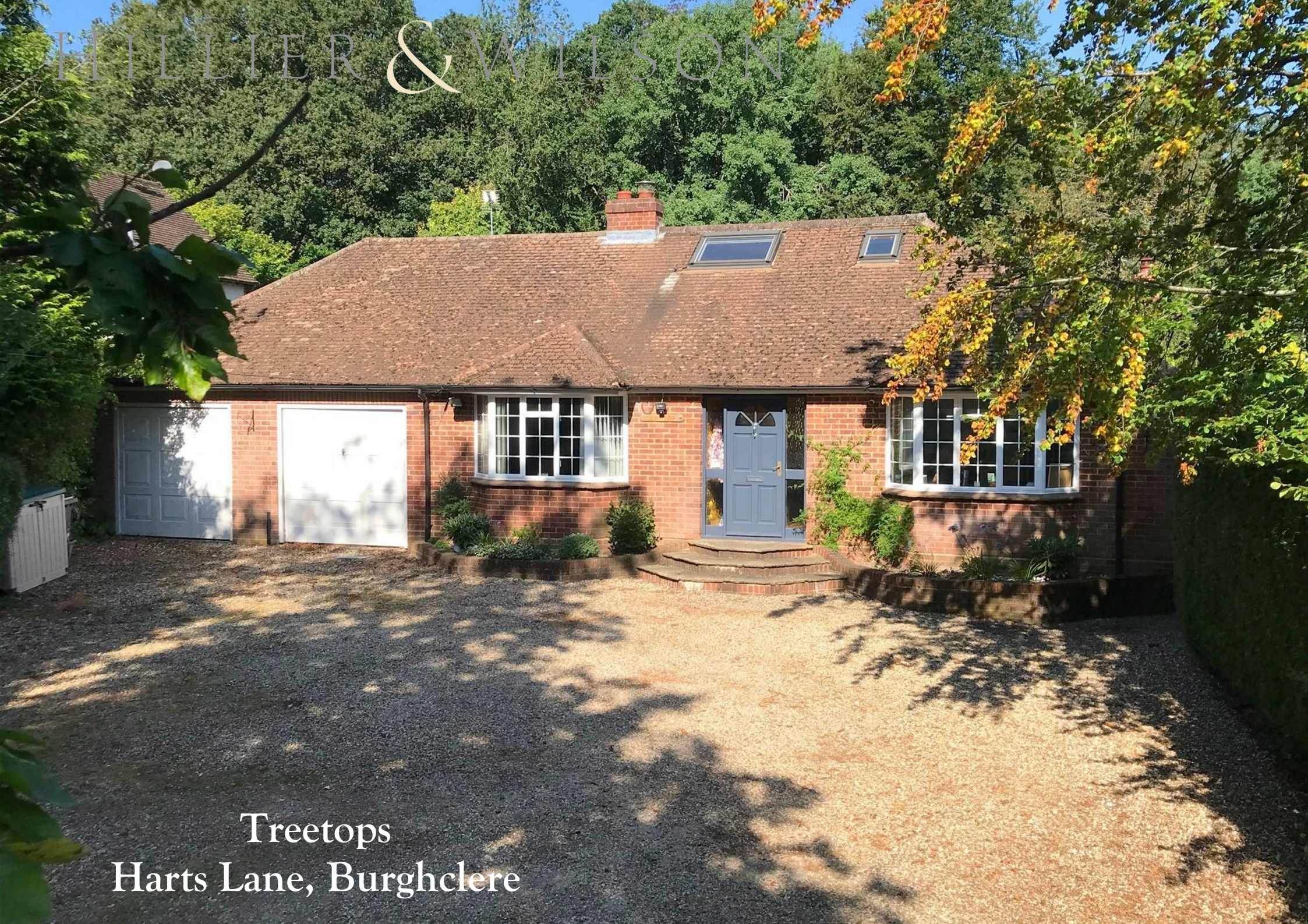
Treetops Harts Lane, Burghclere